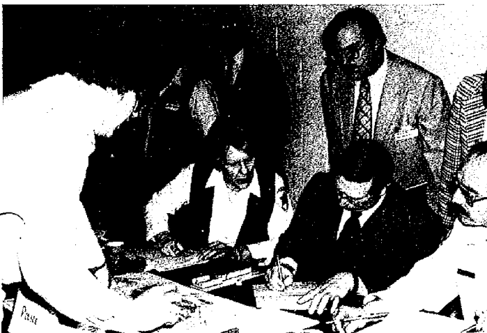
Police and fire volunteers assess damage report

Alsip residents will be proud to learn that the Alsip EOC is one of very few Federally approved units in the State of Illinois because Alsip meets strict requirements for radiation and fallout protection complimented by the design of the Public Safety Building.