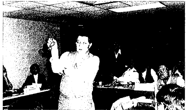
Andrews co-ordinates plans

Huddled closely in the lower level of the Public Safety Building in late March, were a group of volunteers and observers attentively tuned to radio reports of a tornado touchdown in Alsip. But like the Orson Wells radio fiasco of years ago, this scene was not authentic. In reality, the supposed radio broadcast was a pre-taped simulated tornado report compounded by complications of a possible propane gas leak and disruption of a radioactive shipment.