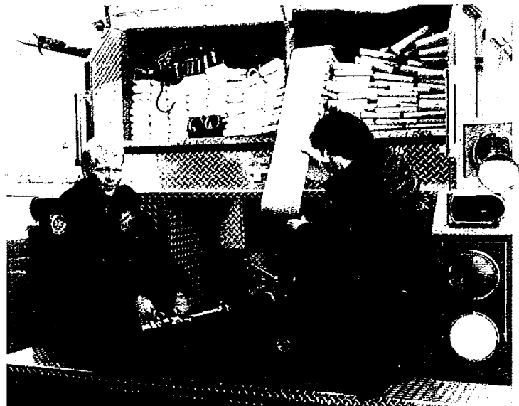
Hose & Tank Housing

Every Alsip firefighter receives initial training in its operation and is required to participate in periodic refreshers.