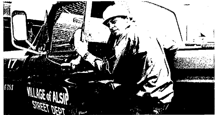
Alsip anticipates clean-up!