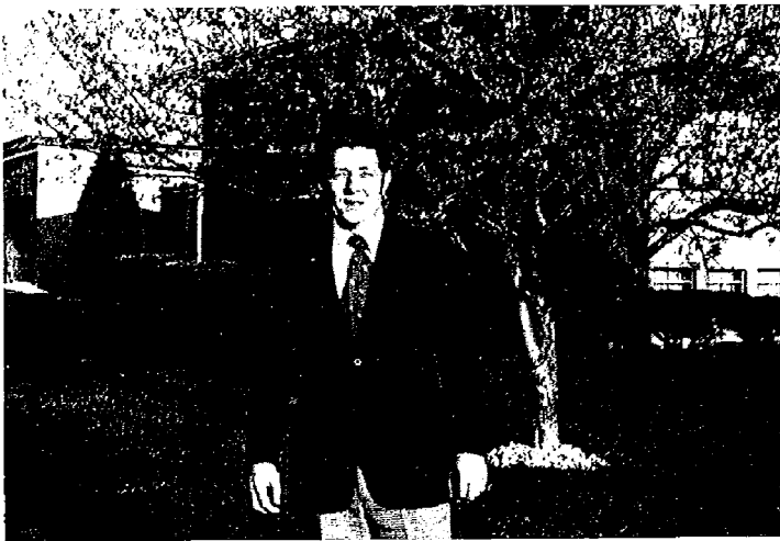
Mayor Arnold A. Andrews urges citizen cooperation

JUST REMEMBER: THE ONLY DAY SUCH SPECIAL PICK-UP WILL BE MADE IS ON YOUR REGULARLY SCHEDULED TRASH PICK-UP DAY, AS IT FALLS DURING THESE SPECIAL TWO WEEKS (MAY 5 & 12). DO YOUR SHARE DAILY TO KEEP ALSIP HEALTHY AND BEAUTIFUL.