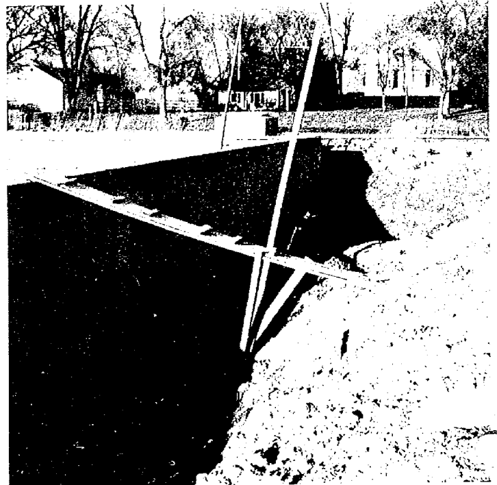
During recent final construction of three million gallon underground reservoir at 117th & Karlov, a catwalk provided access to its spacious flat surface upon which will be built tennis and basketball courts for use by Alsip residents.